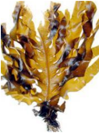
U. pinnatifida forest

Undaria pinnatifida is a brown seaweed that can reach an overall length of about 0.5-3 m (1.6-10 ft). Young plants have an undivided, wide flat blade, while mature plants are distinguished by pinnate or “fingers” dividing the blade, and a fluted, ruffled, spiraling reproductive structure called the sporophyll that forms around the main stem or stipe near the holdfast of the kelp. This sporophyll is not found in native kelp populations. Both the young and mature plants have a midrib, which is not present in most native kelp. The combination of the color, shape, midrib and sporophyll, along with a crinkled texture, distinguish it from related native kelps.