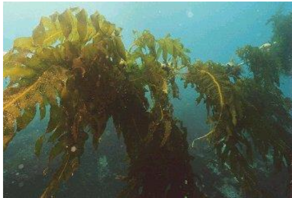
U. pinnatifida thallus